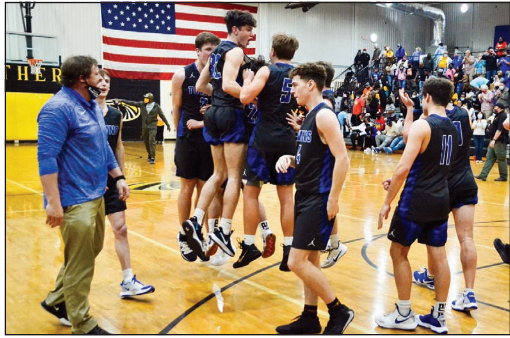
The Towns County Indians celebrated victory in their first Final Four matchup in program history at Chattahoochee County High School on March 6.