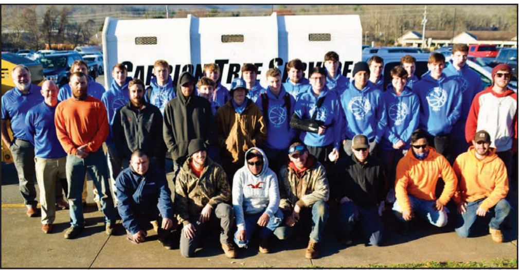
The Towns County Basketball Team accepted a $3,000 donation from Carrion Tree Service on Monday, March 8.