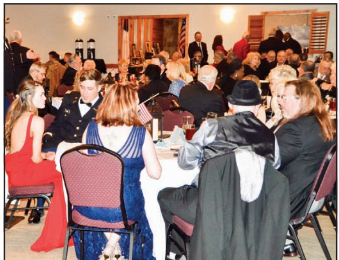
More than 144 people attended the 2021 All Military Ball at the Ridges Resort, marking a major success for the Navy Seabee venture.

"A couple of guys and I got together to start a Seabee